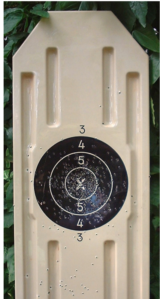
After over 500 rounds of 5.56mm.